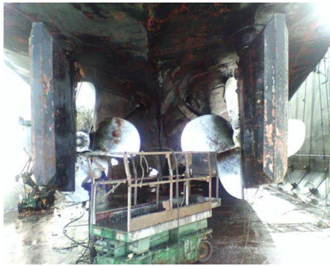
A bottom view of the Pacific Falcon during her dry dock at Duwamish Shipyard in Seattle, WA.