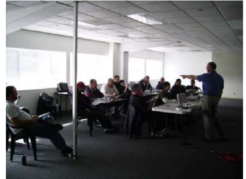
24 Hour HAZWOPER Technician training in San Francisco