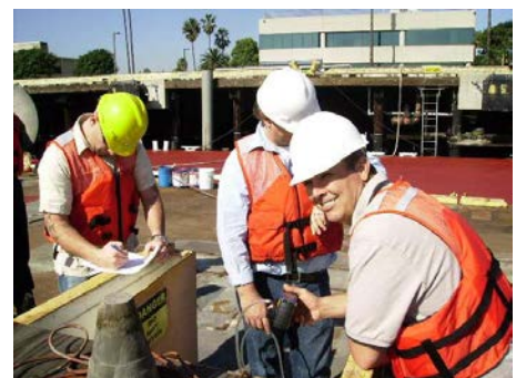
Shipyard Competent Person Training in Los Angeles