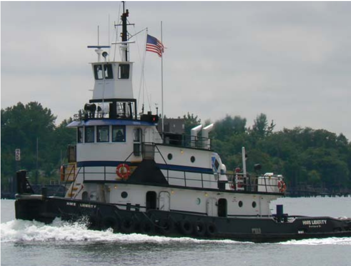
HMS Liberty underway in Kill van Kull between Staten Island, NY and Bayonne, NJ