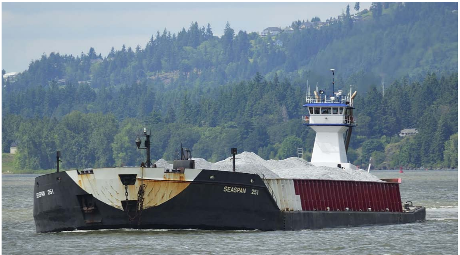
Our Portland based vessel, Willamette Champion, proudly working on the Columbia River

A memory is a terrible thing to waste Come and learn more about this year's Honored Vessel from 1912